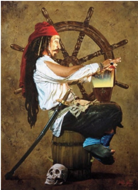
THE PICAROON, OIL ON LINEN, 36 X 26"