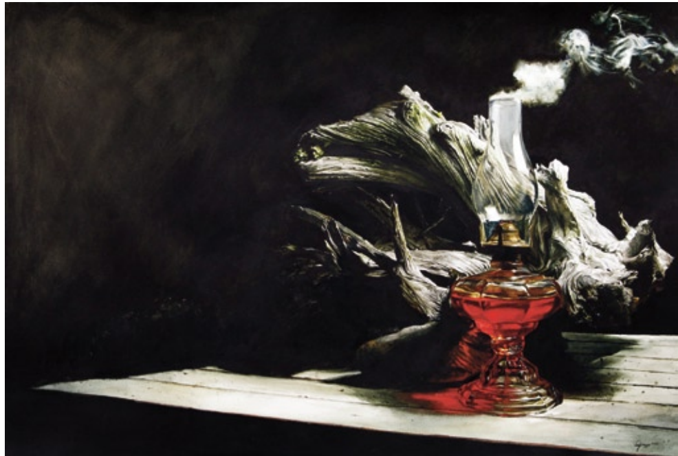
HURRICANE, WATERCOLOR ON PAPER, 23 X 34"